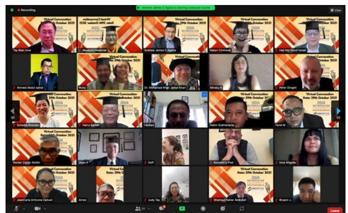
Emeritus graduates looking cheerful and proud with their virtual mortarboard after the virtual convocation event on 29th October 2021.