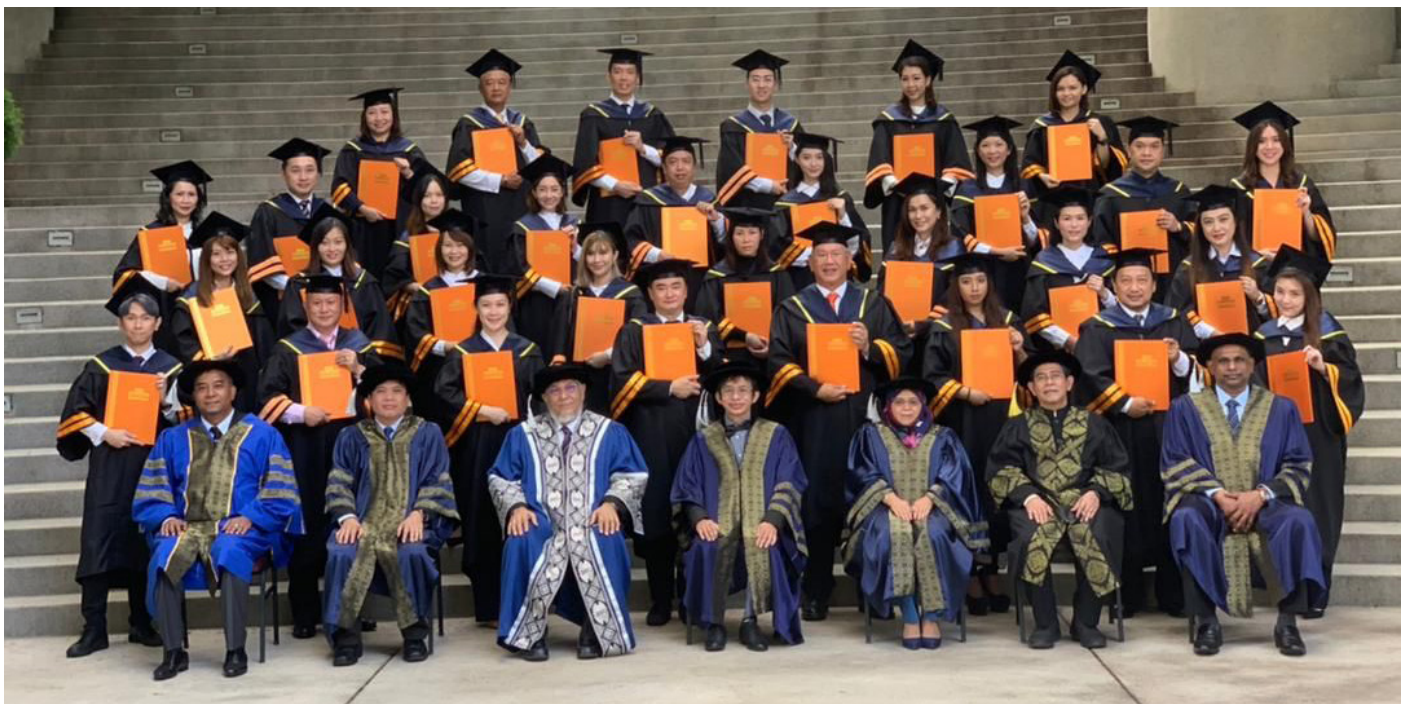
AIMSMET Executive Programmes graduates with Asia Metropolitan University Management Team after their graduation event on 16th November 2021.